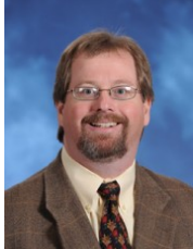
John Bentley Pharmacy