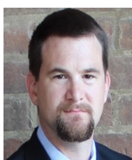
Adam Smith Engineering